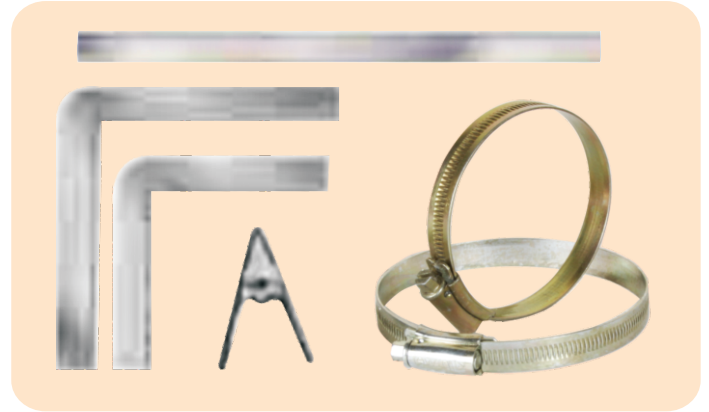
Bus Sheet Installation Tools