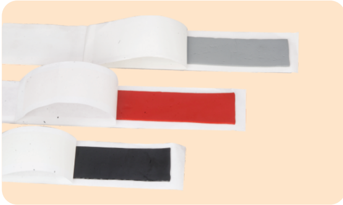
Void Filling & Sealing Mastic